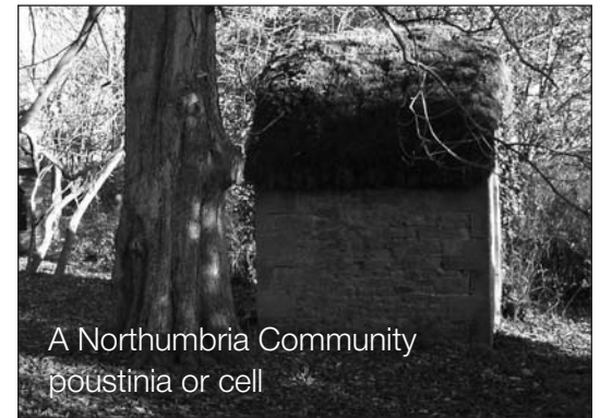
A Northumbria Community poustinia or cell